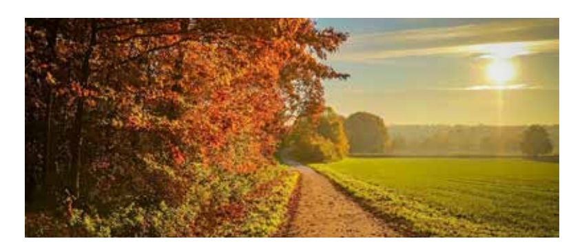
THE STUDY 9:00 – 9:45 am, every Sunday, Youth Building

As for Bible study and knowledge of TRUTH, study the WORD yourself, AND with fellow disciples. Know for yourself, first hand, the scriptures so that you will not be persuaded toward error of false teaching, nor be deceived concerning TRUTH and the will of God.