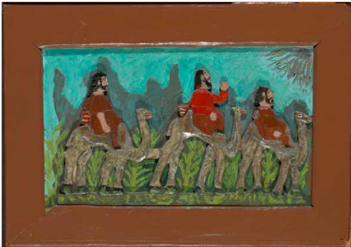
Elijah Pierce, Three Wise Men , ca. 1950. Smithsonian American Art Museum; Creative Commons Zero. https://americanart.si.edu/artwork/three-wise-men-19737